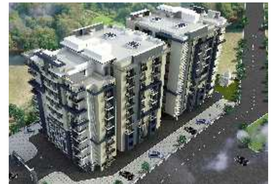
Arihant Shree Krishnam Heights | Nr. Chokhi Dhani | Tonk Road