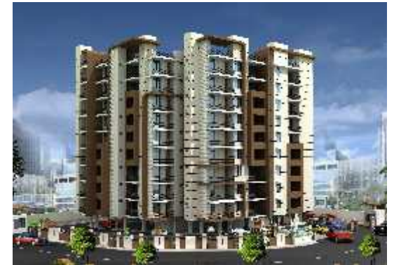
Arihant Shree Krishnam Residency | Opp. Dher ke Balaji Mandir | Ambabari