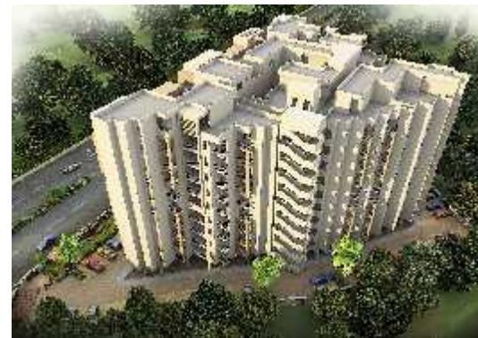
Arihant Sai Residency | Jaisinghpura | Ajmer Road