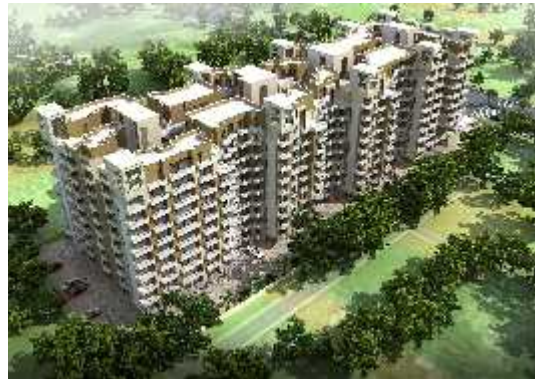
Arihant Dynasty | Patrakar Colony | Mansarovar