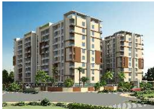
Arihant Legacy | Bilwa, Nr. Chokhi Dhani | Tonk Road