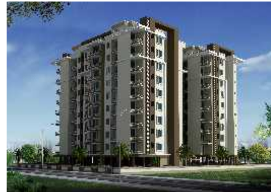
Coral Arihant Heights | Patrakar Colony | Mansarovar